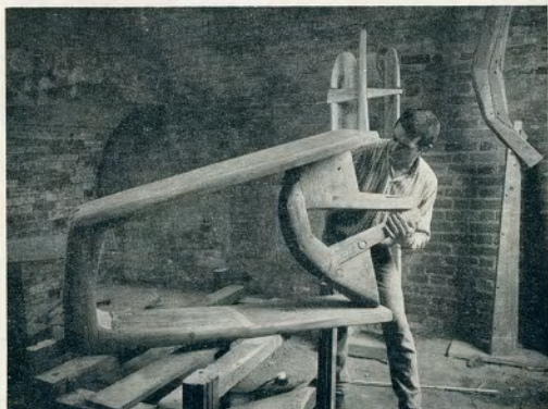
Below left The Artist at work on Genesis 1964 5ft. high New Vision Centre Gallery.